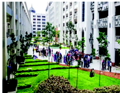
A green environment with on - campus accomodation, plus access to numerous facilities providing students the opportunity to experience a holistic lifestyle.