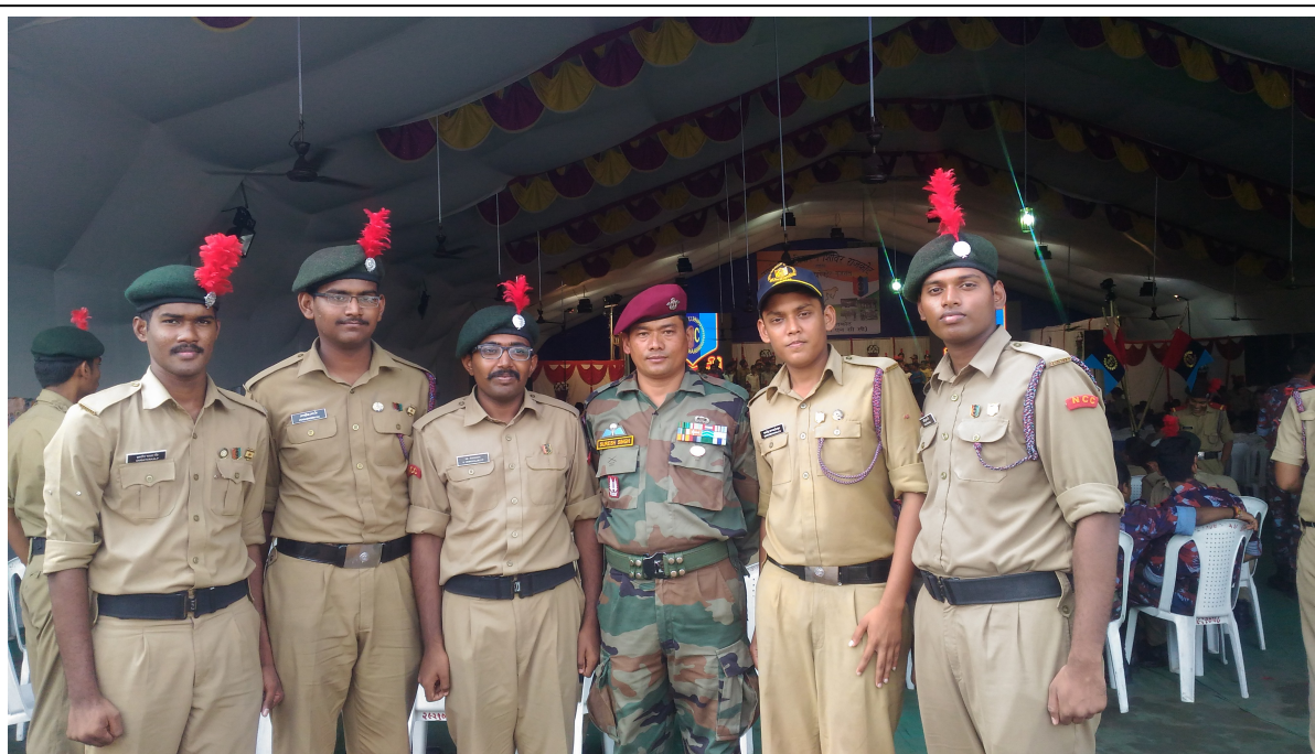
NIC RAJKOT Sep 2017