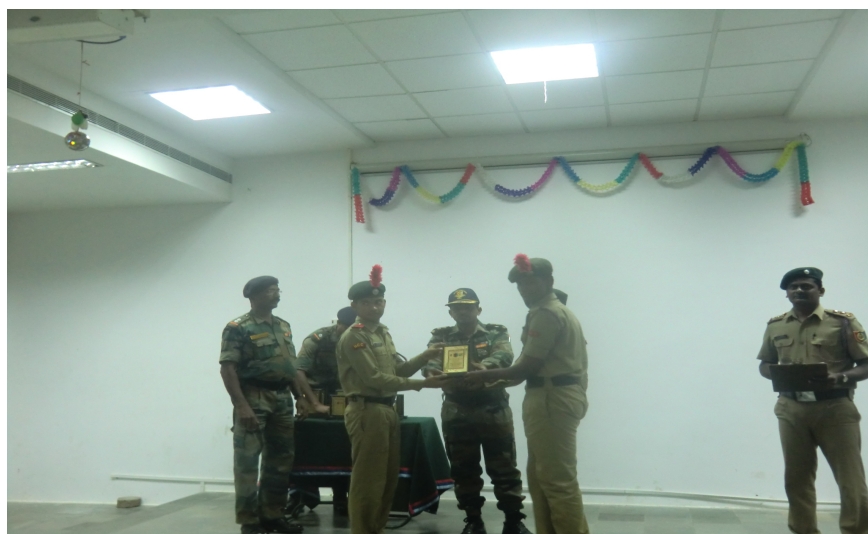
CATC CAMP @ KLU