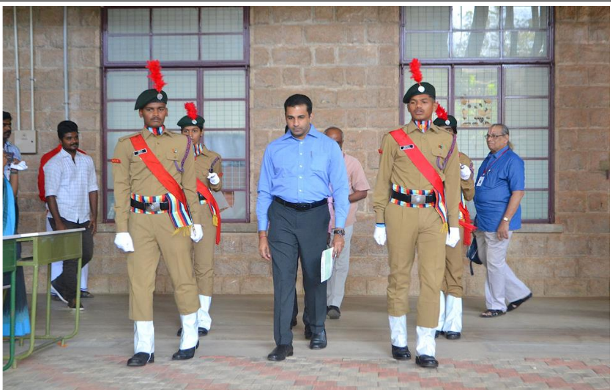
Piloting @ Quest 2018