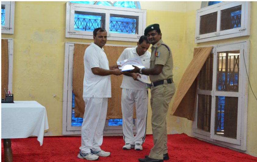
NDRF Training, Sep 2016