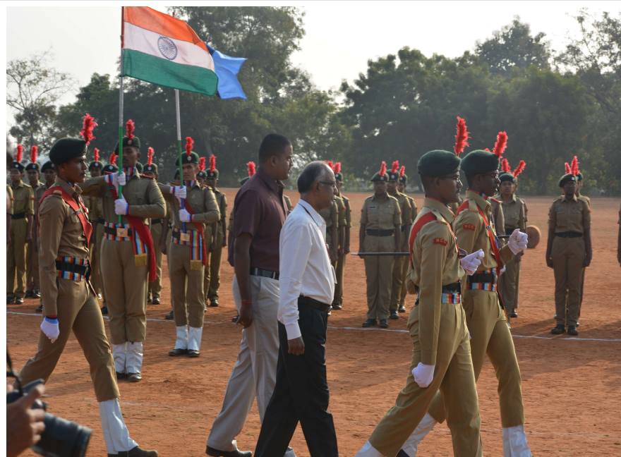
INDEPENDANCE DAY CELEBRATION