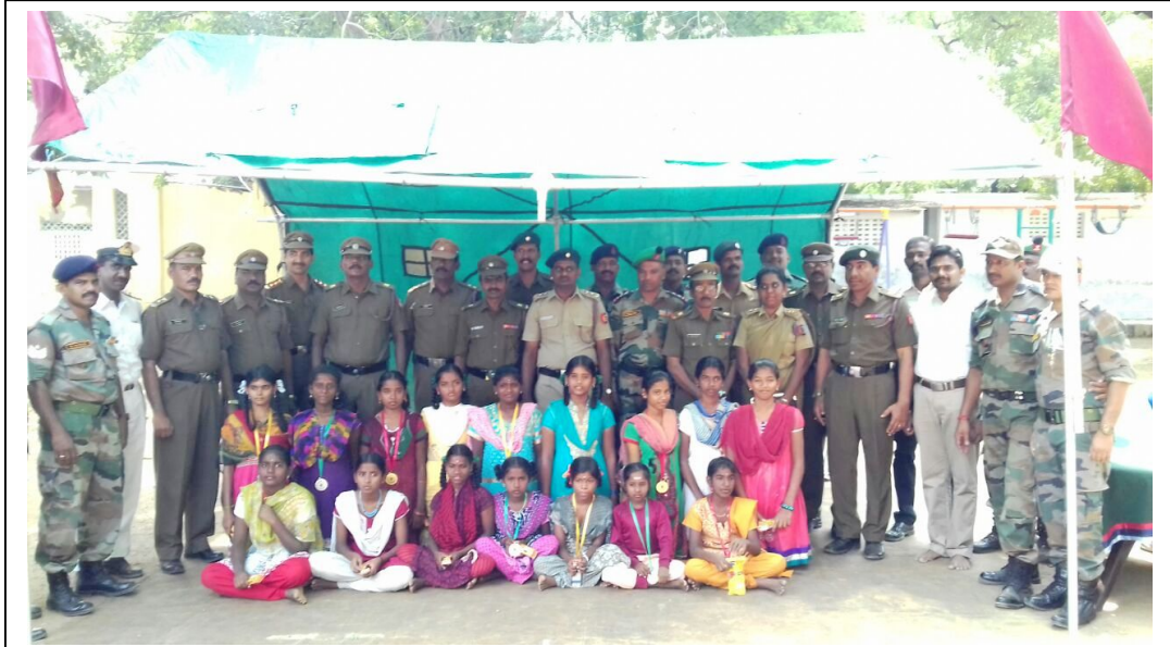
Annai Sathia Ammaiar Govt Orphanage Visit @ Madurai