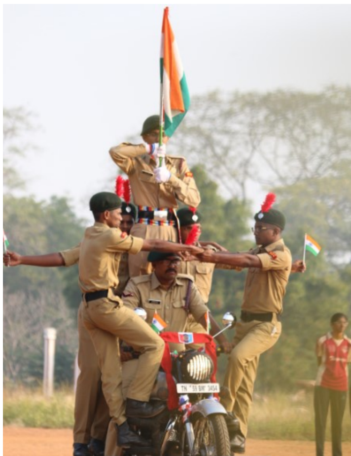
Republic Day 2018