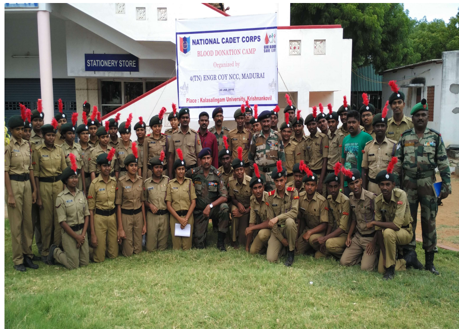
BLOOD DONATION @ KLU