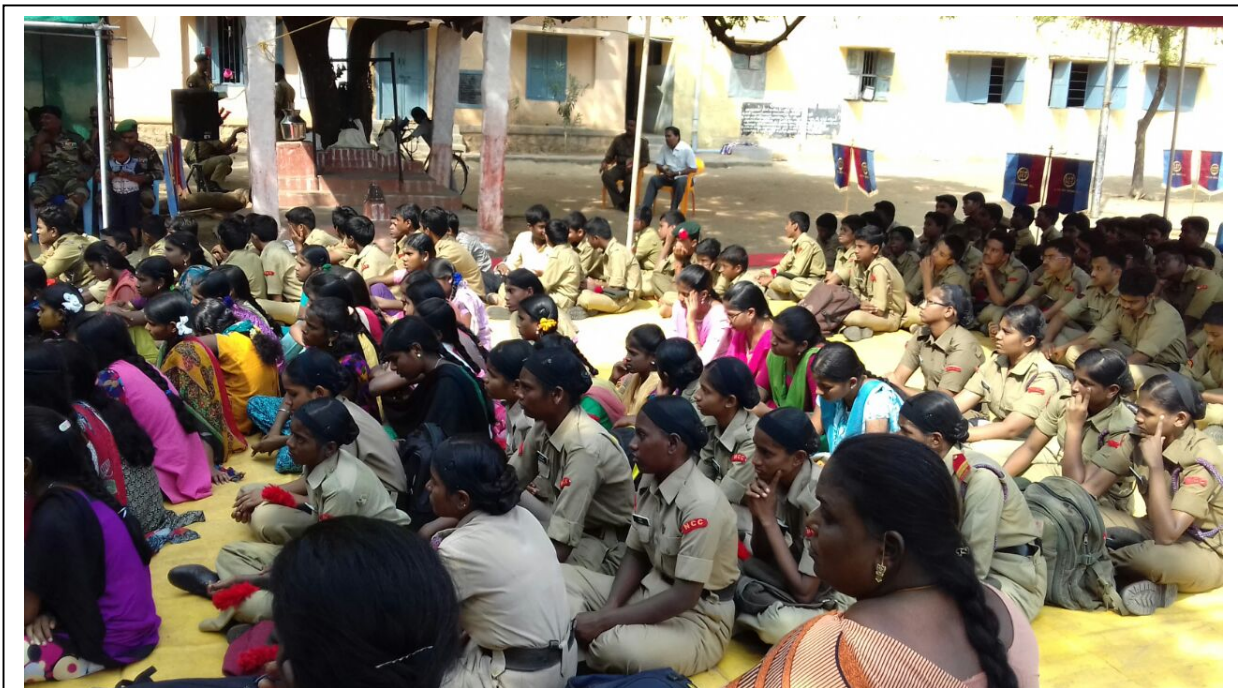
Annai Sathia Ammaiar Govt Orphanage Visit @ Madurai