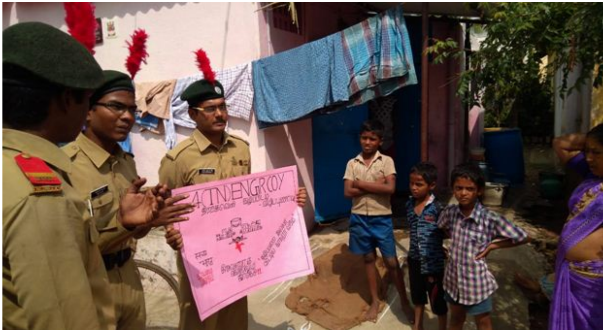
Guard Party at NTA Idayapatty, June 2017