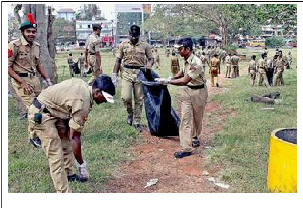
Clean India (Swach Bharat Abiyan) @ Madurai Railway Junction- Oct 2014