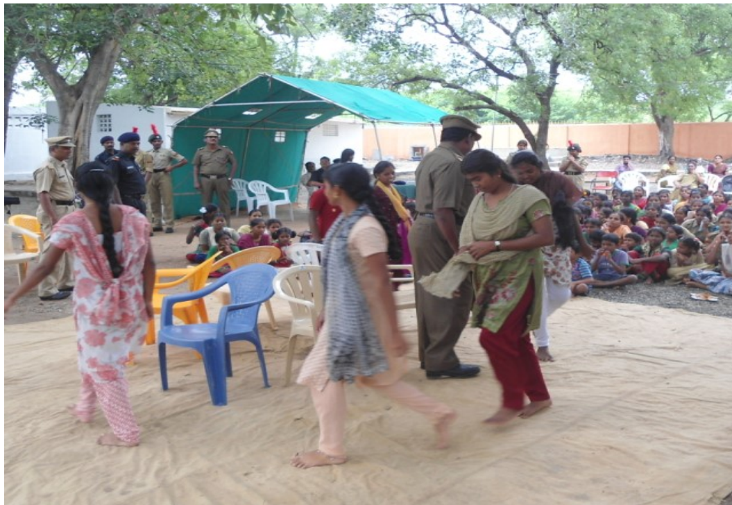
Orphanage home-Annai Sathya ammaiyyar Visit