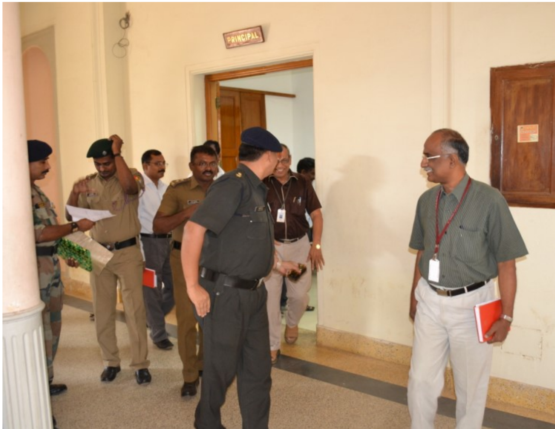
Commanding Officer Visit- June 2014