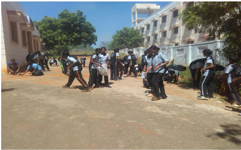
Swachh Bharat Sep 2016